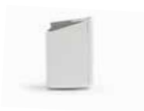
A fully charged Naída CI PowerCel™ 170 Battery