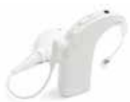
A Naída CI set to a program appropriate for Roger use

You will need the following equipment to use the Roger 17 receiver with the Naída CI sound processor: