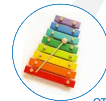
OTHER SYSTEMS up to 22 bands