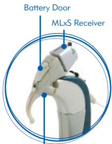
iConnect™ Earhook Fig. 1: Auria Sound Processor with the Auria iConnect Adapter and MLxS