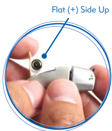
Fig. 3: Inserting the size-10 battery