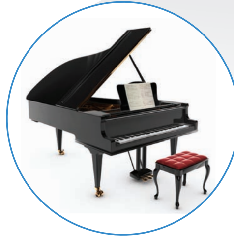
HARMONY up to 120 bands