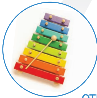
OTHER SYSTEMS up to 22 bands