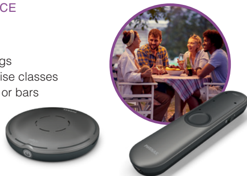
Roger Select™ wireless microphone