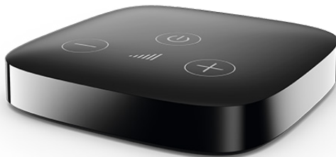
PHONAK TV CONNECTOR