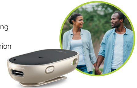
Phonak PartnerMic™ microphone