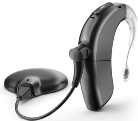
MARVEL CI SOUND PROCESSOR WITH BLUETOOTH TECHNOLOGY