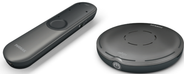
ROGER ON™ AND ROGER SELECT™ WIRELESS MICROPHONES