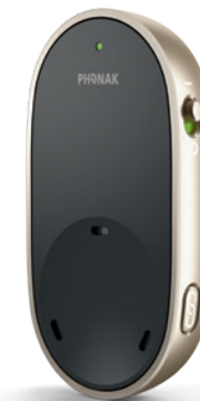
PHONAK PARTNERMIC™ MICROPHONE