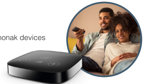
Phonak TV Connector

At Advanced Bionics, we believe everyone can live without the limitations of hearing loss. That's why we've developed the most flexible, innovative, and patient-centric cochlear implant solutions available today.