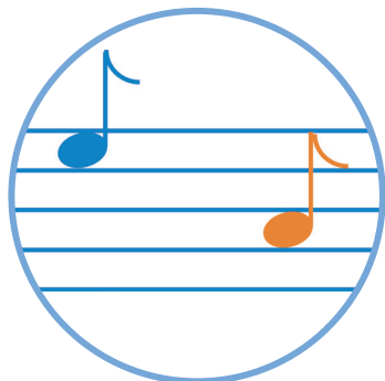
Tone 1 Higher Pitch